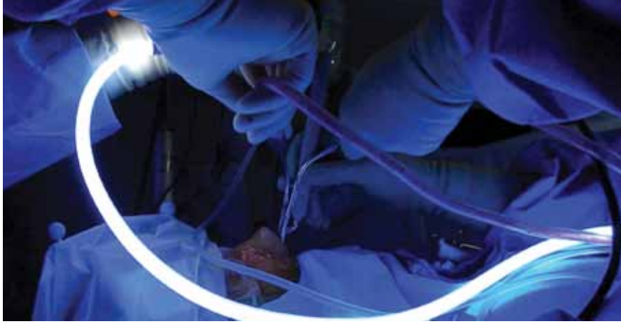
Minimally invasive endoscopic approaches can now be safely and effectively used to access tumors of the paranasal sinuses and skull base.