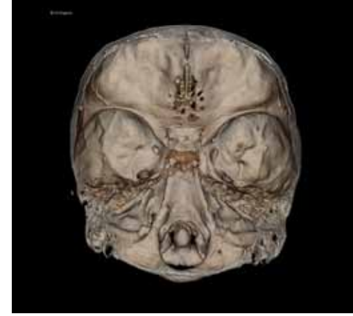
3D reformation of CT scans showing normal anatomy of the skull base.