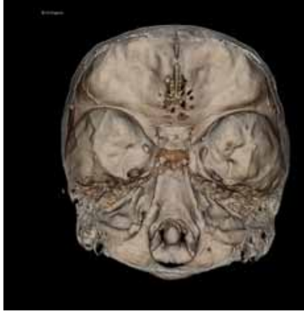
3D reformation of CT scans showing normal anatomy of the skull base.