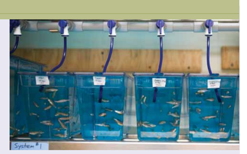
A phenotype-based screen of 320 FDA-approved compounds revealed that the antihistamine clemizole can inhibit seizures in a zebrafish model of Dravet syndrome.